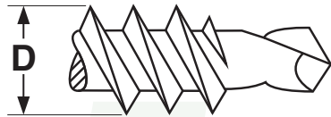
Fine Thread Drill Point Drywall Screw